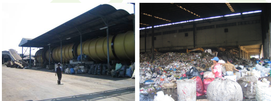
Bangkok Metropolitan Site

Sampling and analysis was performed by Environmental & Resource Development Co. Ltd. The purpose of the sampling was to assess the effectiveness of BiOWiSH™ Odor in reducing odor emissions from the solid municipal waste and its impact on local residents.